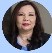
Senator Tammy Duckworth TammyDuckworth.com