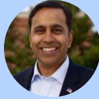
Congress 8 Raja Krishnamoorthi RajaForCongress.com