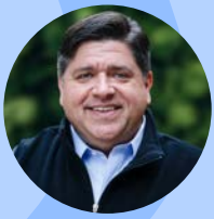
Governor JB Pritzker